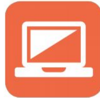
Business and Industry