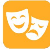
Arts and Humanities